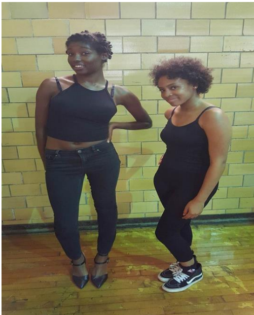
Photo shoot photographers: Tyrone Price of Magnum Photos and Kennautis Smith