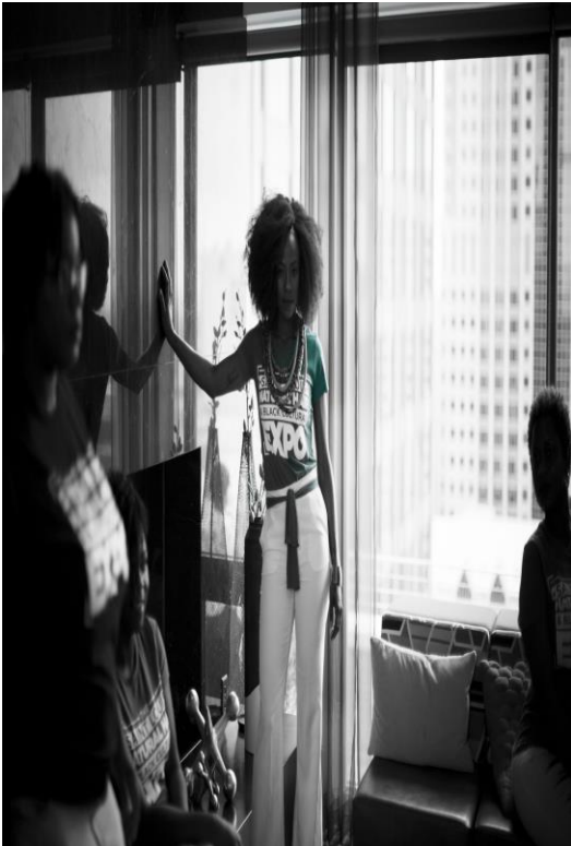
(above/below) Expo 2017 Models strikes a pose