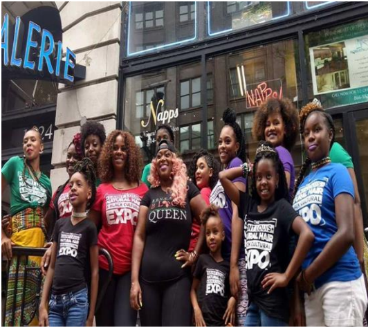
(above) MUA Slay Queen & Expo 2017 Models

Models take a moment to pose with their makeup artist, Slay Queen . Photo taken in front of NAPPS Natural Hair Salon.